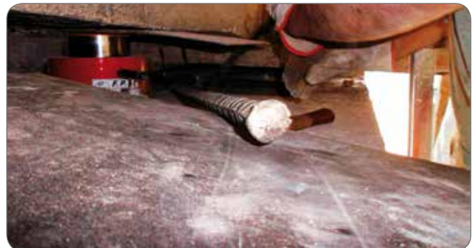
100 ton compact cylinder – spring return with unidirectional flow control valve