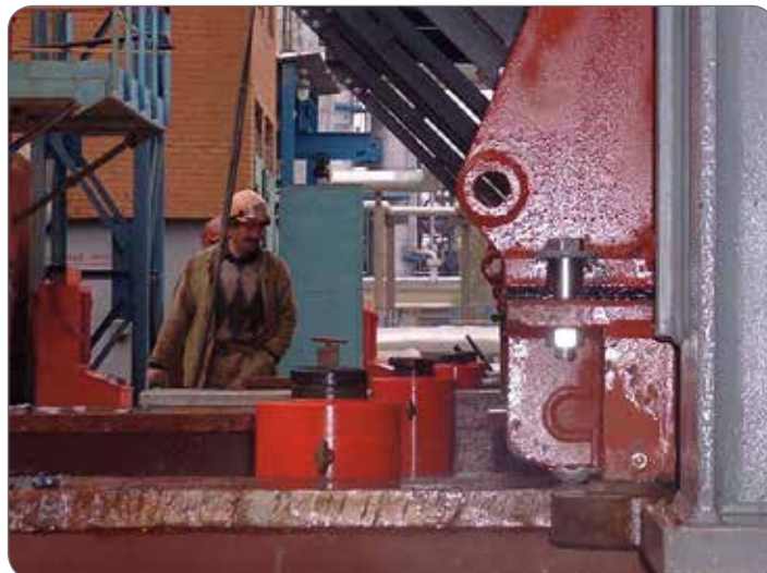
Compact cylinder with spring return (100-ton capacity and 50 mm stroke) and self-levelling head.