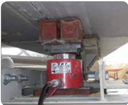
100 ton-capacity compact cylinder - Model F.P.T. CRM100/50C 100 ton capacity, 50 mm stroke